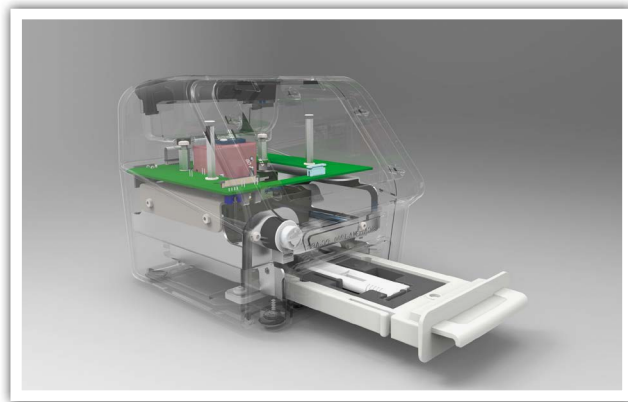
Scanning system and detector